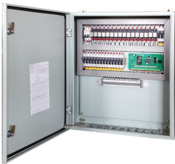
WT-R/Q信号采集箱 signal collection box